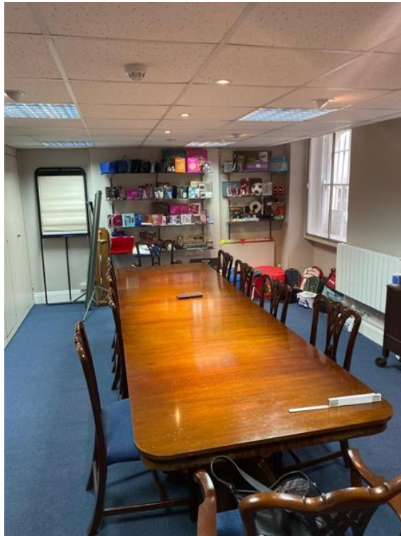
Meeting room above