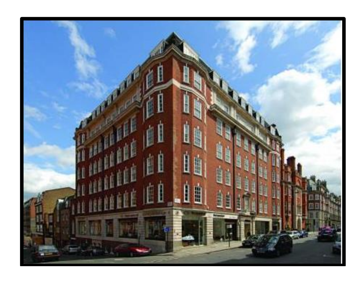
Claridge House, 32 Davies Street, Mayfair W1 1,185 sq ft -110 sq m