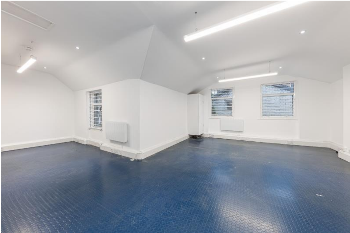
First floor rear